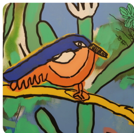
Mural in the making for the Friends of Cherry Hinton Brook